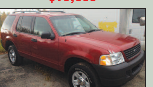
'03 Ford Explorer Tilt, cruise, CD