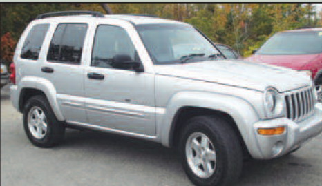
'03 Jeep Liberty 106K, loaded From $199 Mo.*