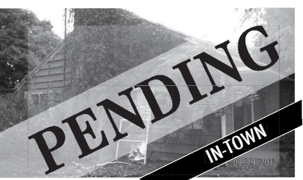
215 PROSPECT STREET, CHARLEVOIX

Solid in-town home. Ranch styling makes it a convenient floor plan. Attached garage will make those cold winter days not seem so bad! Many conveniences within walking distance for most buyers, and this one won't last long! MLS 434718. Ask for Mike