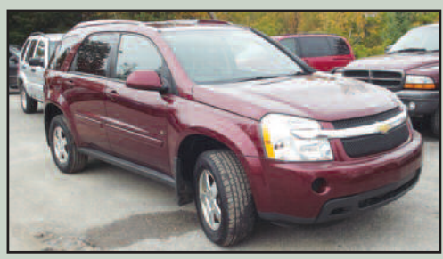
'07 Chevy Equinox AWD From $249 Mo.*