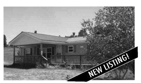
9875 PARADISE HILLS, CENTRAL LAKE

On the outer edges of town, this single story home has a very unique layout. Although in need of cosmetics and some repairs, the potential is there for a great home or investment income. Easy access to the attic area also offers potential for finishing some area for extra play, storage, or sleep. MLŠ 435009. Ask for Mike Stark. $45,000