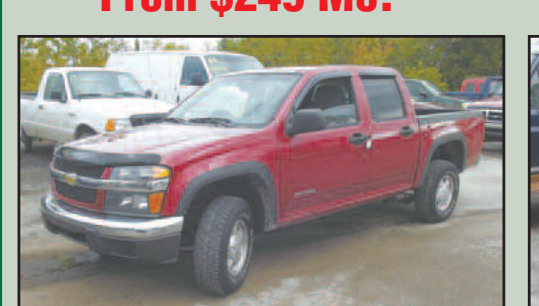
'05 Chevy Colorado 4x4 Crew cab From $199 Mo.*