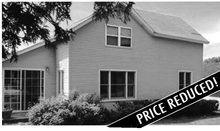
00853 FOURTH STREET, CHARLEVOIX

Great ranch style living! A nice garage, along with spacious living and kitchen areas add to this country homes charm. Well maintained, with 2 options for heat, and many other features will make this one a quick sell. Give us a call today for a personal showing MLS 435190. Ask for Jennifer Burr-Cutler. $64.900