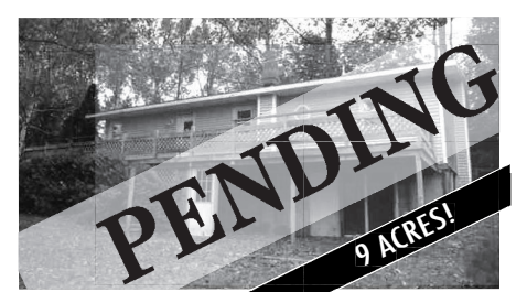
781 PARSONS ROAD, CHARLEVOIX

This is a beautiful piece of property right on the edge of town. Acreage is on a dead end street and very private. Would make for a perfect walk out basement. City water and sewer are available for hook up. Drive by or call for your personal tour today! MLS 430403. Ask for Jennifer Burr-Cutler.