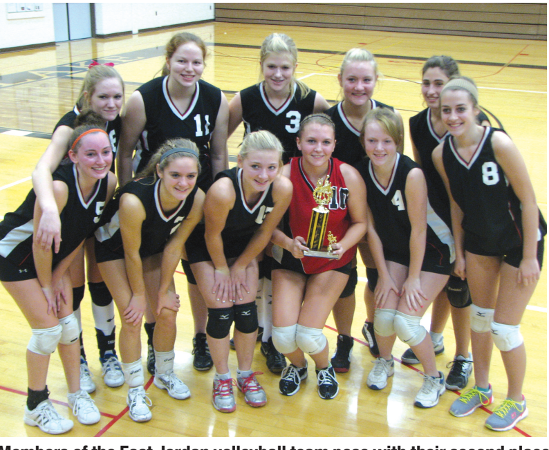
Members of the East Jordan volleyball team pose with their second place trophy they earned at the Glen Lake Invitational Volleyball tournament.