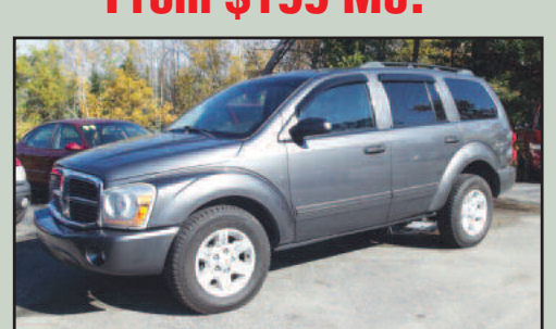
'04 Dodge Durango Like new, new tires, 3rd row $8.995