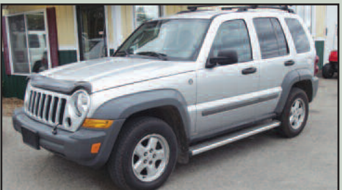
'05 Jeep Liberty Diesel 4x4, 85K miles, great mpg $11,999