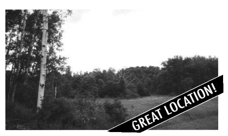
750 SEVENTH STREET, EAST JORDAN

This home has been completely remodeled! New vinyl windows, new maple floor covering which includes a 30 year warranty! Multiple new fixtures, cabinets, countertops, toilet and vanity. New deck on the back to enjoy the view of the acreage.Only 7 miles to Boyne Mountain, 1 block from Alba Schools and RIGHT on the snowmobile trail! MLS 435051. Ask for Jennifer Burr-Cutler. $49,900