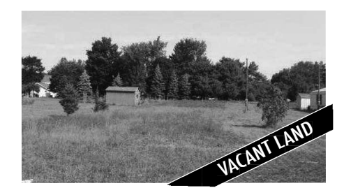
BENNETT, EAST JORDAN

Vacant lot on the edge of town. This property has city water available as well as natural gas, and properly zoned for single-wide or manufactured home. MLS 434873. Ask for Mike Stark. $6,000