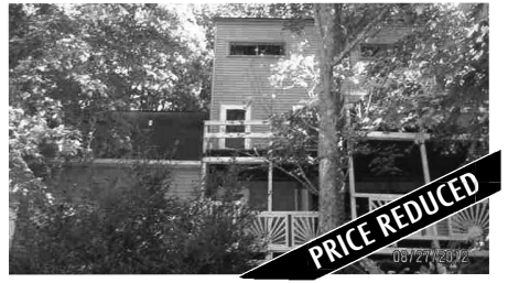
3446 OLD STATE, EAST JORDAN

Potential Development opportunity, roperty has a proposed 36 and 60 unit Hotel plans with prints drawn up that are available for review. Prime intown location. 322 feet of an uninterrupted view of the natural Jordan River Basin, and incredible wildlife habitat. MLS 432831. Ask for Jennifer Burr-Cutler. $140,000