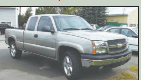
'03 Chevy Silverado Extended cab From $249 Mo.*

*Plus tax, title, license fees. Approved credit. See dealer for details.