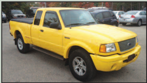
'02 Ford Edge Ext. cab, 4-dr., low miles From $199 Mo.*