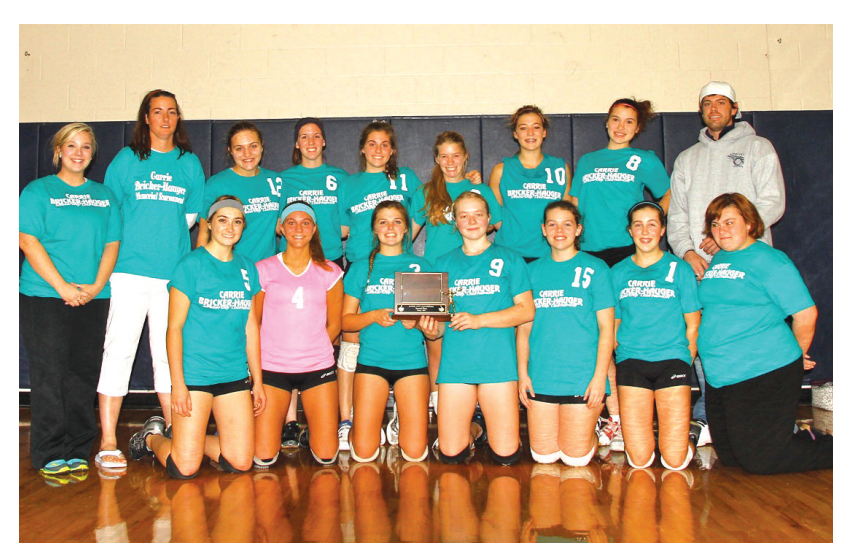
The Boyne City volleyball team poses with their second place trophy at the Carrie Bricker Memorial Tournament in Boyne City.