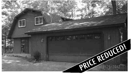
4610 DEL MASON, BELLAIRE

Looking for maintenance free living in northern Michigan? This condo is move in ready and the tasteful furniture and furnishings can be negotiated with the sale! Need a place to park your boat? This condo offers that too! With the marina, launch and beach around the corner as well as a restaurant/bar this condo is the perfect getaway... Ask for Jennifer Burr-Cutler. $86,000