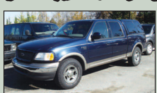
'03 Ford F-150 Crew w/topper, new tires $10,900