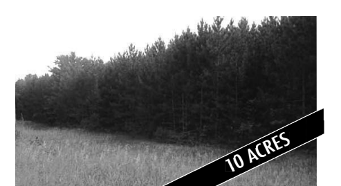
TBD STANEK ROAD, EAST JORDAN

Vacant lot on the edge of town. This property has city water available as well as natural gas, and properly zoned for single-wide or manufactured home. MLS 434873. Ask for Mike Stark. $6,000