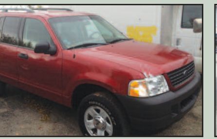
From $199 Mo.*