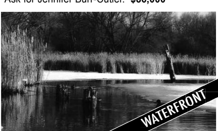
TBD MILL STREET, EAST JORDAN

105 FIFTH STREET, EAST JORDAN Style, charm and location! This home has it all as well as a very recent updates. Back yard is fenced in for convenience, and the home offers a nice front porch to enjoy the outdoors! Sitting in the heart of East Jordan, it is close to the schools, downtown and entertaining and an easy drive to work! MLS 435249. Ask for Jennifer Burr-Cutler. $109,000