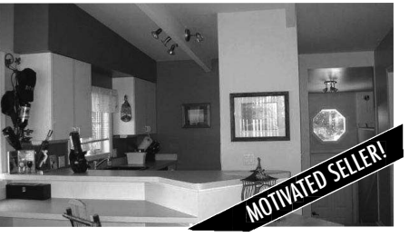
13456 STOVER ROAD, CHARLEVOIX

Rare opportunity for a highly visible, high traffic count location for your service or retail business! New road out front, septic currently but sewer is ready to be tapped in. Detached 1 car garage with gas heater. Open floor plan with 2 private offices, full kitchen, full bath with shower and rear entry area. Large corner lot. Additional parcel in back is also available. 435118. Ask for Mike Stark. $59,900