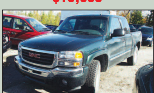
'06 GMC Sierra SLE Ext cab $16,900